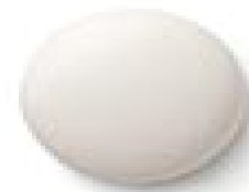
Nest Temperature Sensor (2nd gen)

Mounting screws and wiring labels (Not shown)