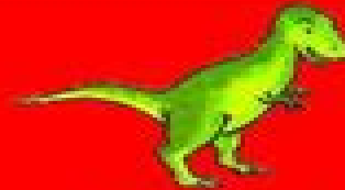
البراكسورس وركس Tyrannosaurus Rex