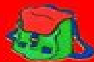
حقيبة مدرسية schoolbag