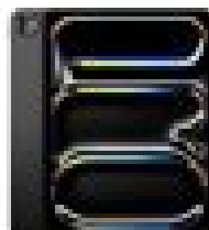
iPad Pro (M4)