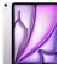
iPad Air (M3)