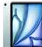
iPad Air (M3)