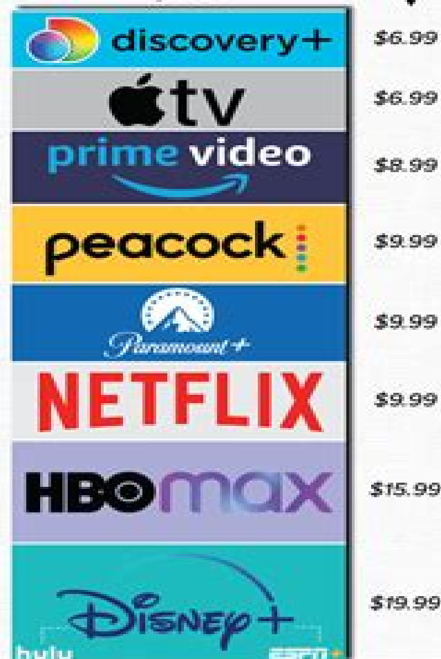
Sum Cost of Ad-Free Streamers