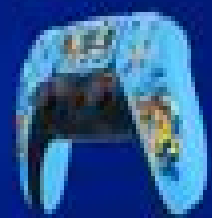
Fortnite Limited Edition DualSense™