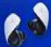
PULSE Explore™ Wireless Earbuds