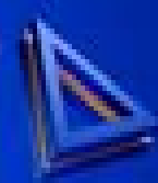
PS5™ Console Covers