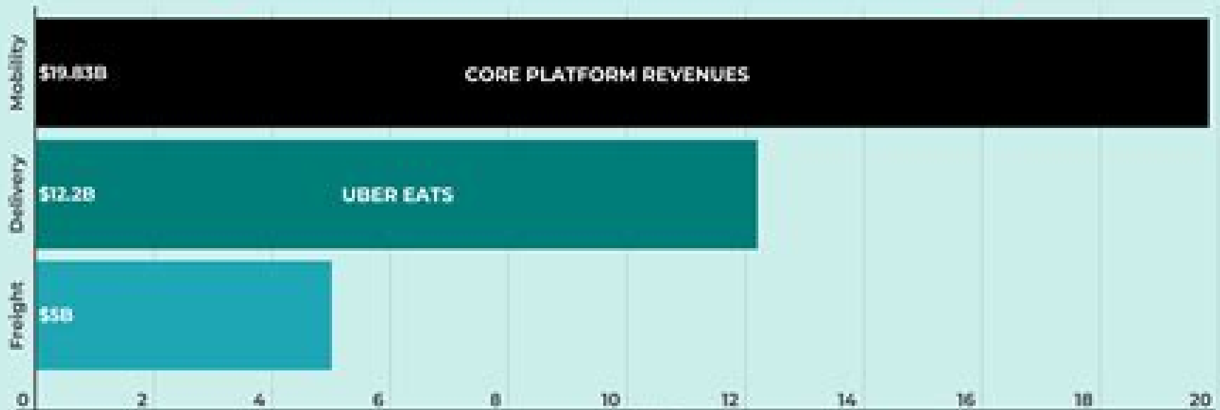
Revenue Per Segment