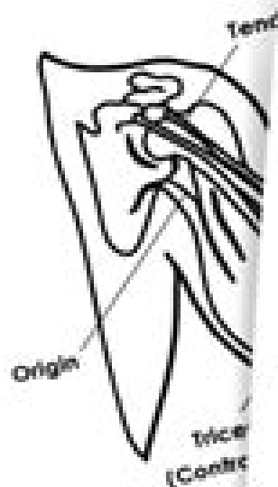
Muscular System 7a