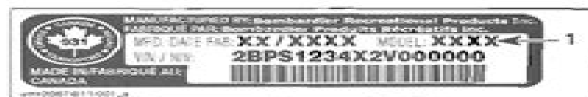
1. Model number

The Vehicle Model Number is scribed on vehicle description decal.