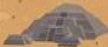
TEOTIHUACÁN EDO DE MÉXICO