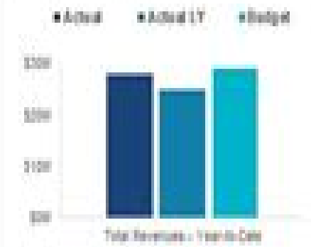
Total Revenues - Year-to-Date