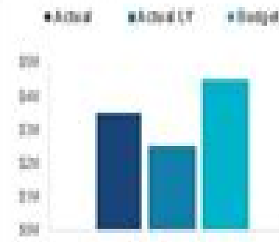
Total Revenues - Month