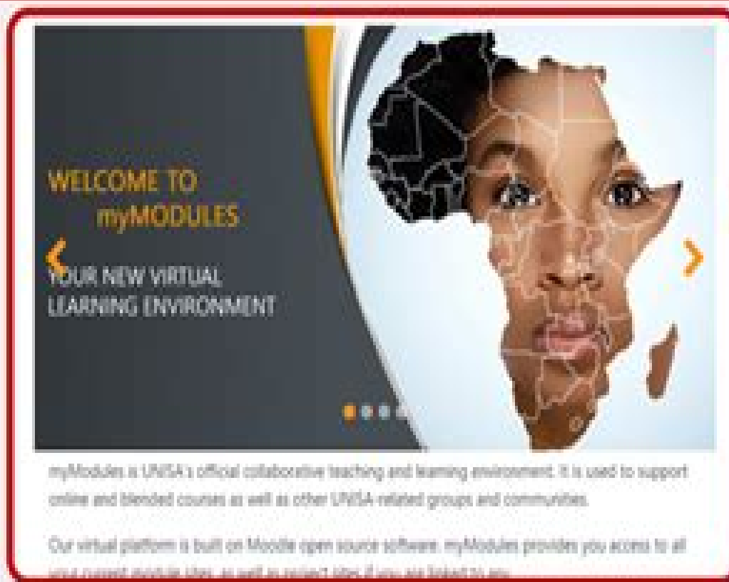
Main content area.