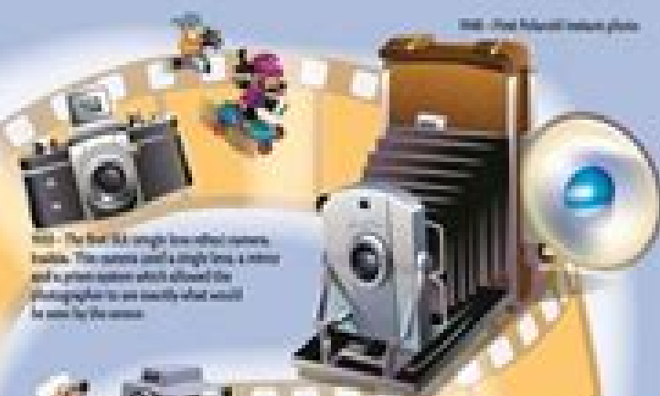
1925 - The first 35mm single lens reflex camera (Leica). This camera used a single lens, a mirror, and a prism system which allowed the photographer to see exactly what would be seen by the camera.