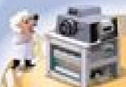
1975 - Eastman Kodak introduced the first digital camera that displayed photos on its screen. Digital cameras can store more photos than film.