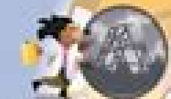
1839 - The first glass negative was used in Daguerre's process which needed exposure to make a negative and then processing to turn it into a positive to develop and fix the image. These plates were one of a kind and took only 15 minutes to take the photo.