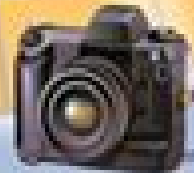
1991 - Nikon offered the first DSLR, digital single lens reflex camera, which combined a digital imaging sensor with the mechanics and optics of a single lens reflex camera.