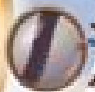
1816 - Camera Obscura is used to make an image on metal plates coated with chemicals. This was when the first permanent photograph was taken! It took 8 hours to take this photograph!