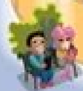
2000 - First camera phone is produced in Japan.