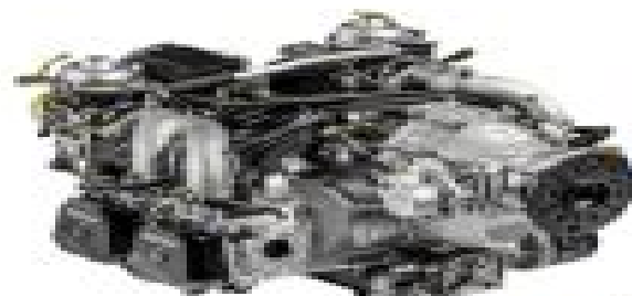
912 A / F