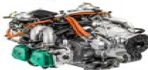
912 S / ULS