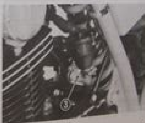
(3) Transparent section