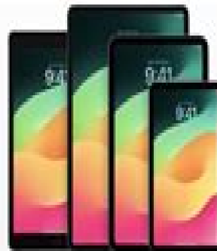
Table of Contents ⓘ