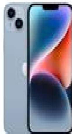
iPhone 14 Plus