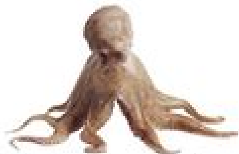
California Two-Spot Octopus