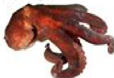
North Pacific Giant Octopus