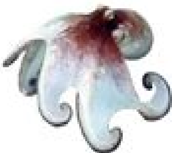
Caribbean Reef Octopus