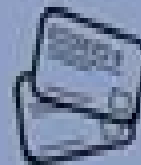
Federal student loans