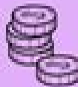
Private student loans