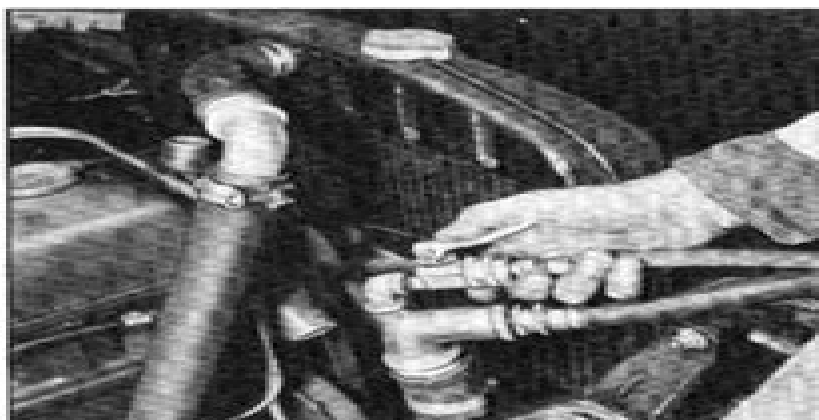
Fig. 121—Reverse Flushing Radiator

CAUTION. Apply air gradually as a clogged radiator will stand only a limited pressure.