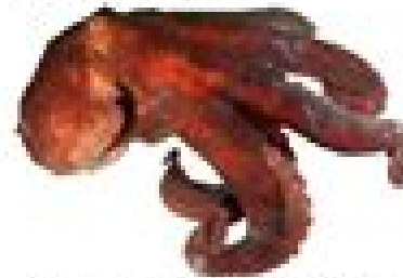
North Pacific Giant Octopus