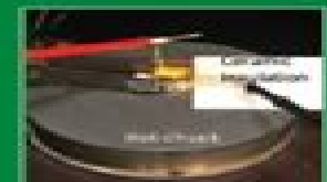
SiC PIN Diode test setup