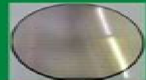
700um support silicon wafer