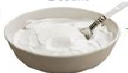
Greek Yogurt 1 cup