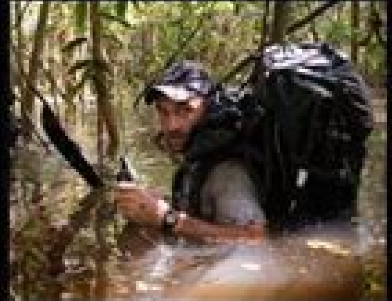
What my grand mother thinks I do