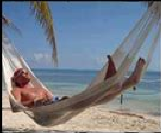
What my friends think I do