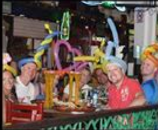
What my parents think I do