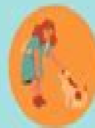
Spending Time With Pet & Animals