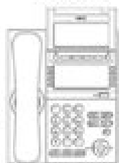
DESI Less 8 Button