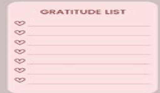
5 minute journal